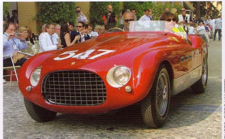
Ferrari 340 MM