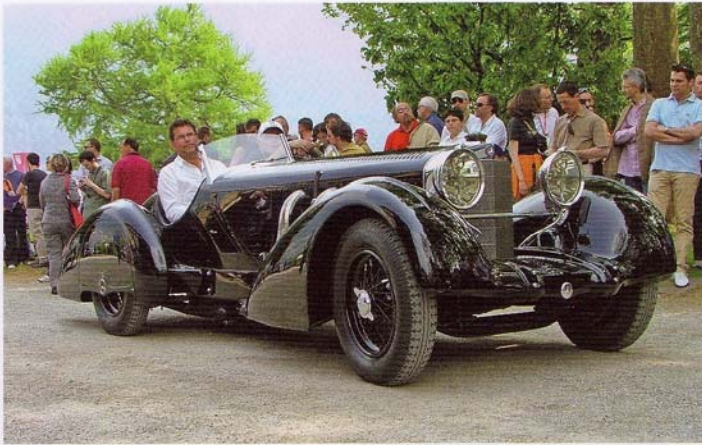
1930 Mercedes Benz SSK owned by Ralph Lauren