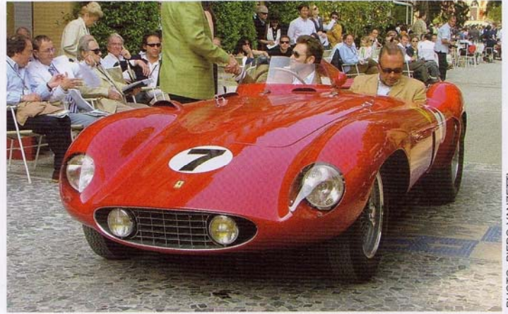
Ferrari 121 LM