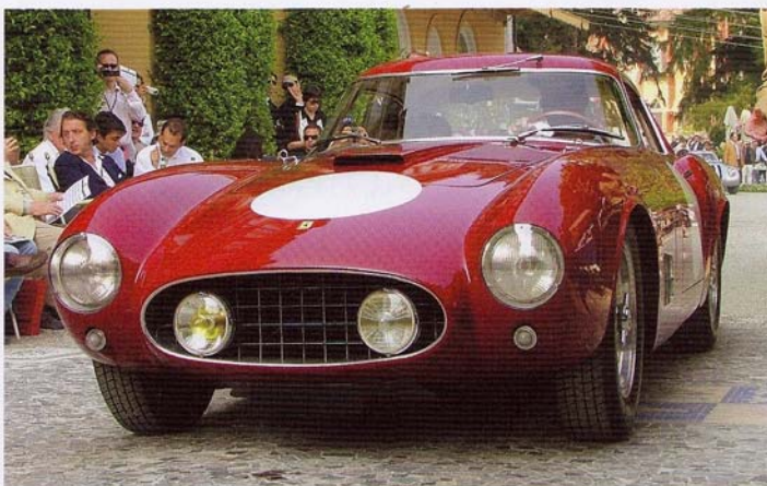
Ferrari 250 GT LWB Tour de France