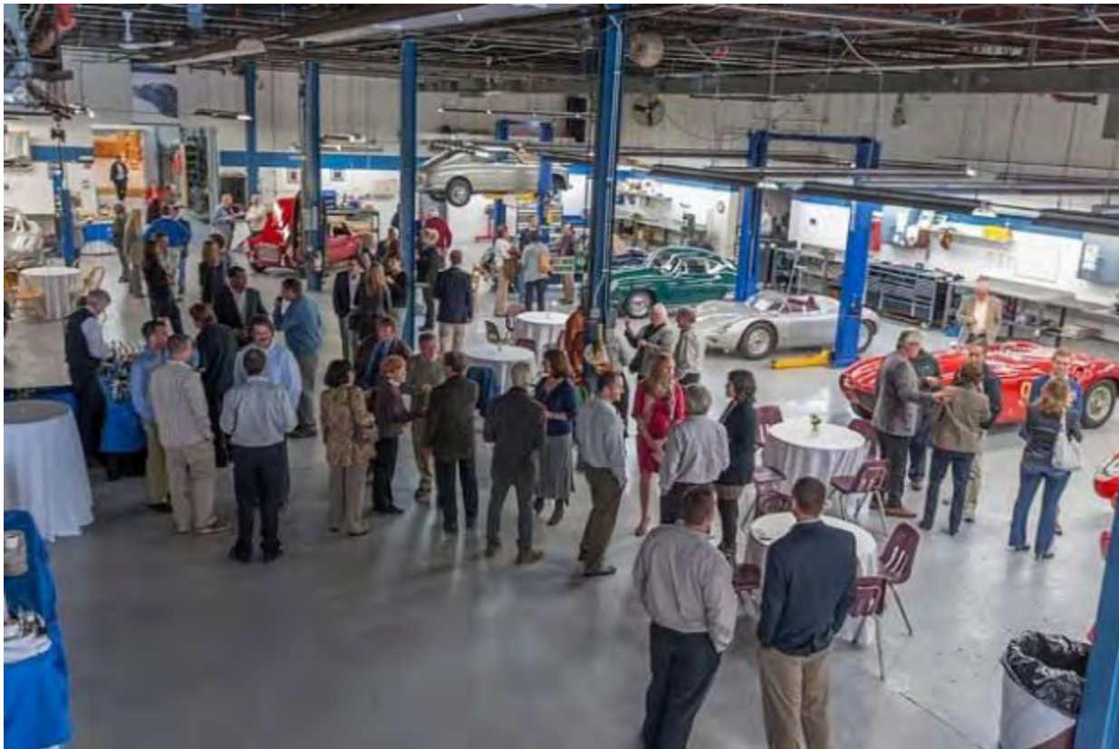
Guests were treated to a reception in Paul Russell and Company's shop, prior to the unveiling of the star of the show.